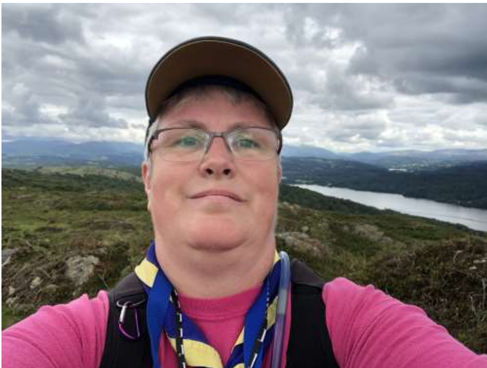
Photo taken on Scout Summer Camp, August 2024 in the Lake District