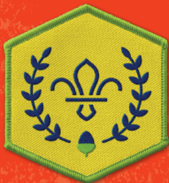
Chief Scout's Acorn Award