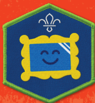
All About Me