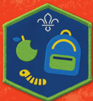
All About Adventure