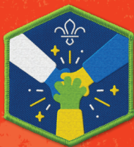
All Around Us